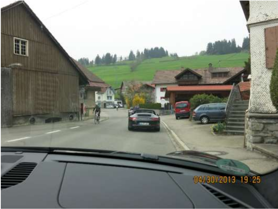
Driving through a small German village.