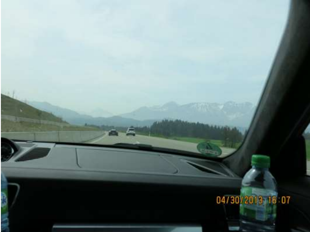
In the fast lane wide open.