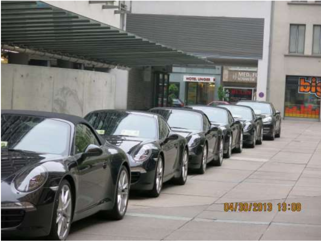
Our Avis rental car lined up and ready to go.