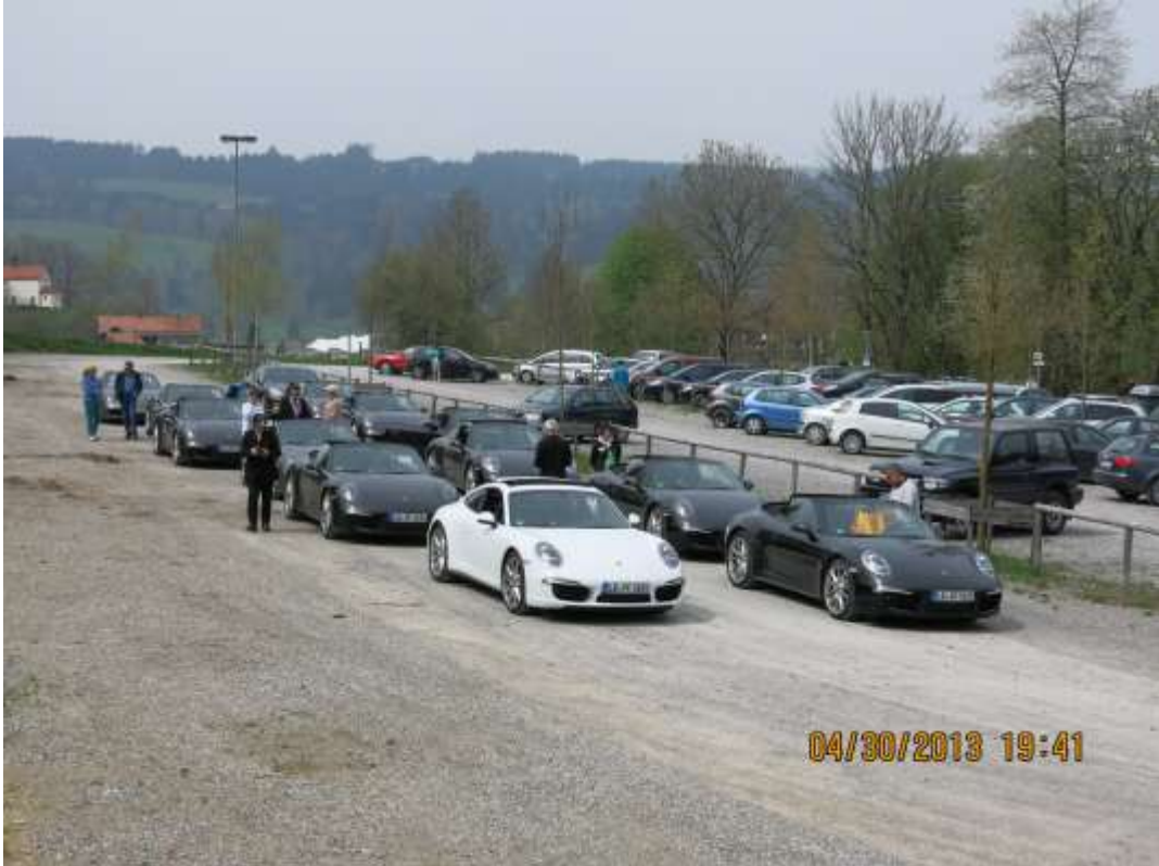
Taking a break.